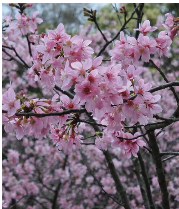
Yangmingshan Flower Festival

The Parks and Street Lights Office has specially invited the Chen Ya Lan Taiwanese Opera Troupe to portray celestial beings at the opening ceremony, presenting blessings in this time of global epidemic. During the Peace Memorial Day holiday there will be a Cherry Blossom Picnic & Love Flower Concert, and there will also be DIY handicraft dyeing experiences, eco-challenges, and other splendid fun-filled activities. Cooperating restaurants and other food and beverage businesses will also be offering attractive discounts. These many draws allow folks to enjoy fantasia-like seas of flowers without heading abroad.