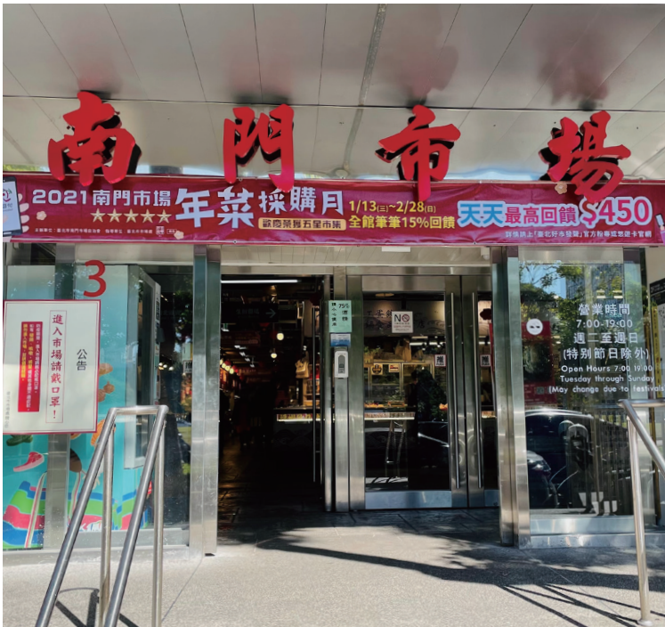
Nanmen Temporary Market