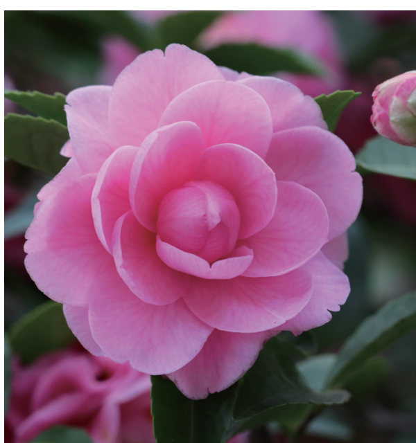
Taipei Camellias Show / photo by Parks and Street Lights Office, Public Works Department, Taipei City Government

The camellias blossom each January, with the bloom extending into March. The Floriculture Experiment Center is immersed in fragrance, and the Taipei Camellias Show is staged at this time. Camellia experts from all around the country are invited to come showcase their most rare and precious camellia gems, in a grand, compellingly lovely combination display of flowers and trees. You're warmly welcomed to come take in this rich visual feast of camellias, forest, and bonsai treasures!