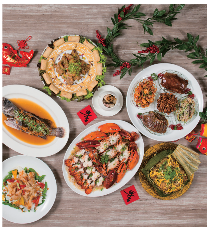
New Year's Eve Weilu

During the meal the ideal is to stretch the meal as long as possible, eating slowly. This symbolizes "long life" for everyone. Every dish placed on the table this day has auspicious meaning. The names for "hairy vegetable" and "making a fortune" are homonyms (facai). Round tangyuan, small glutinous-rice dumplings, symbolize completeness and reunion. Another dumpling called jiaozi, often translated as "Chinese dumpling," symbolizes traditional Chinese ingots because of the shape. Served this night with their full stems intact, commonly eaten spinach and mustard leaf become "long life vegetables." As well, the meal must have a fish dish, for "fish" and "surplus" are homonyms (yu), symbolizing the expression "surplus year after year" (nian nian you yu).