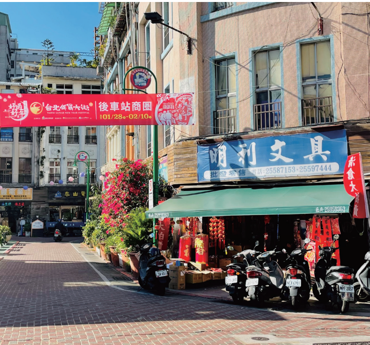
Taipei Rear Station Commercial District