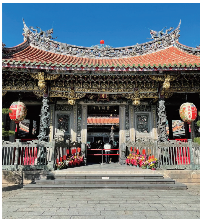
Bangka Longshan Temple

Bangka Longshan Temple was established in 1738. Legend says that during the Second World War was hit by Allied bombing, yet afterward the Guanyin Bodhisattva statue enshrined within sat safe and sound upon her lotus seat. This miracle has become a pillar of belief among devotees. Today the temple remains as busy and filled with incense aroma as ever, and has been listed as a national heritage site. It is one of the city's top three tourist attractions with visiting international travelers, along with the National Palace Museum and Chiang Kai-shek Memorial Hall. During the Spring Festival holidays, why not visit and pray for safety and good fortune for yourself and your loved ones!