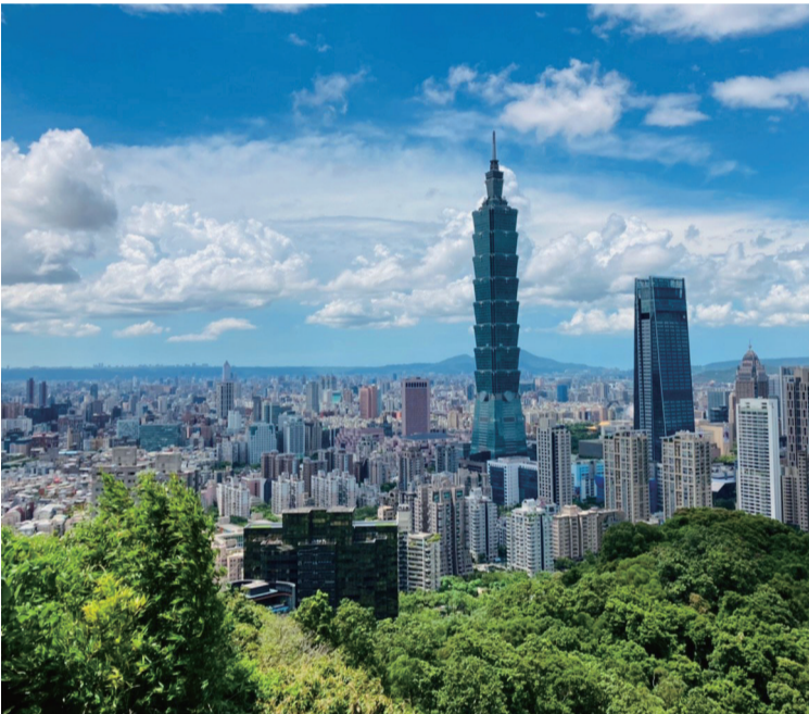
Xiangshan Hiking Trail

This old Japanese-style residence, located along Qingtian Street at No. 6, Lane 7, was built around 80 years ago during the 1895-1945 Japanese colonial period. In 2006 it was formally designated as a municipal heritage site. It is now open for public visit, with free guided tours and lecture series organized, and with food and beverage services offered. If you have some free time, why not take a trip through time, savoring the old stories and tranquil air conjured by this vintage house!