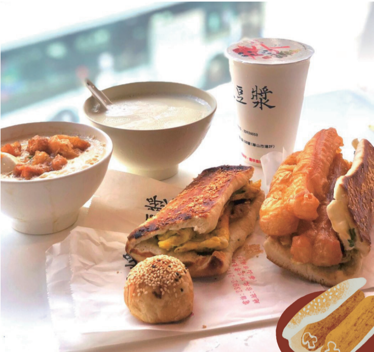
Fu Hang Soy Milk

Breakfast is a person's source of vitality for the coming day. Fu Hang Soy Milk, found on the second floor of the venerable Huashan Market, has been operating more than 60 years. It has been a Michelin Bib Gourmand recommendation each year since 2018. It can be called one of Taipei's must-try breakfast joints, and from the moment of opening each day welcomes a never-ending stream of customers. Must-order menu items are the soy milk, salty soy milk, thick shaobing (roasted flatbread), youtiao (deep-fried cruller) wrapped in flatbread, caramel sweet crepe, and egg crepe. If you'd like to try the many delicious Fu Hang Soy Milk tastes, it's recommended you come line up early, to avoid a long wait!