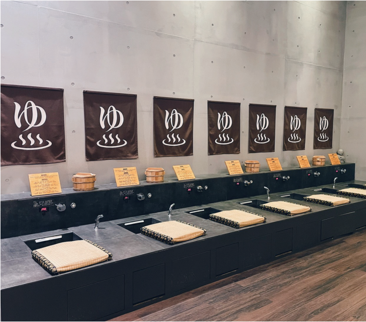
Young Song Shu 3