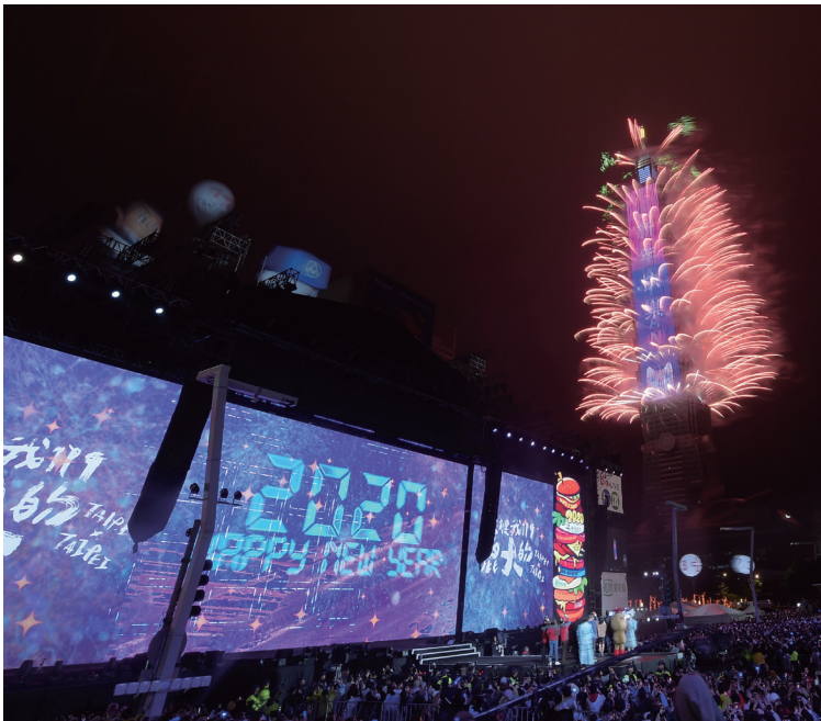
Taipei New Year’s Eve Countdown Party