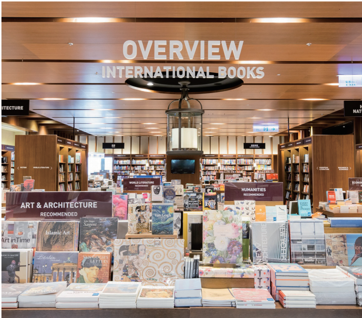
Eslite Xinyi Store