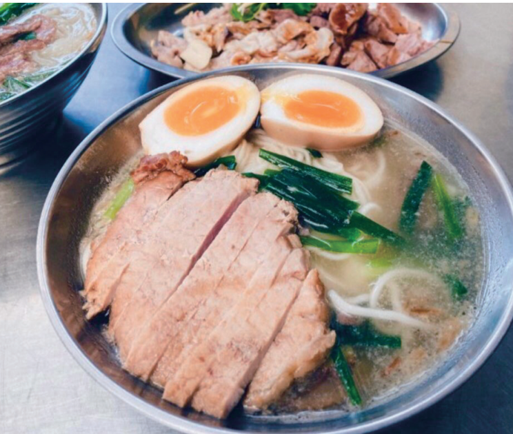
Chang Hong Noodles