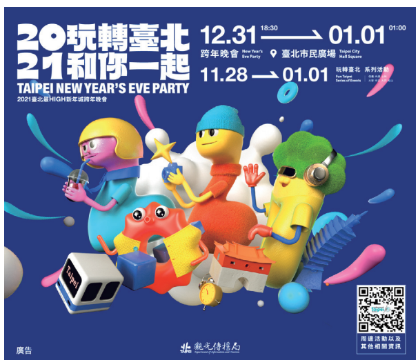
2021 Taipei New Year's Eve Party