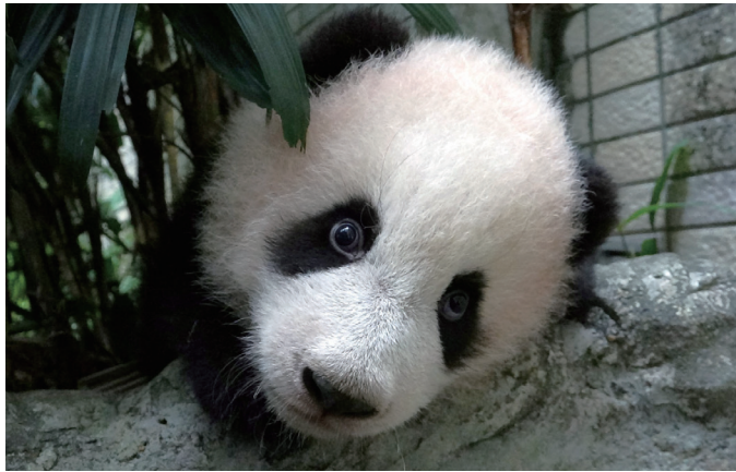
Great Panda Baby Jewel—Yuanbao