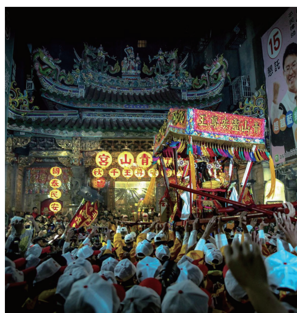
Qingshan King Festival