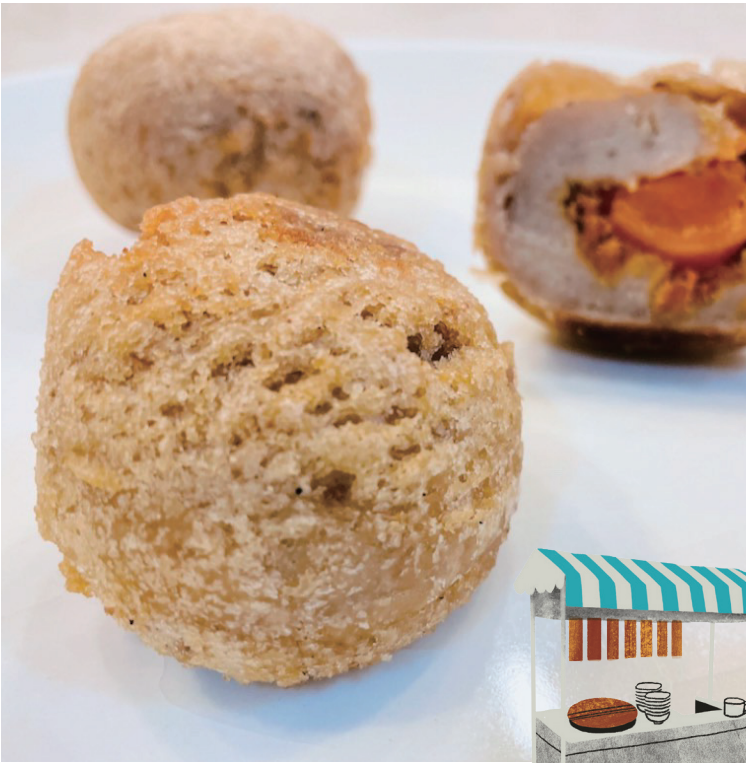
Liu Yu Zi Fried Taro Ball