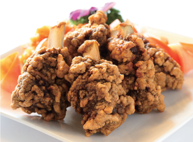
deep-fried pork ribs