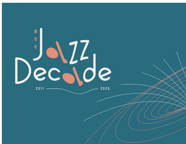
2020 Taipei Jazz Festival

The theme for this year's festival is "Jazz Decade" celebrating the past 10 years of jazz in Taiwan. Through the staging of this year's music celebration, developments and achievements in Taiwan jazz over the past decade are being presented. At the same time the festival is serving in a role as bridge, connecting musicians with the public, Taiwan, and the wide world, with the goal of helping the jazz music scene develop even more vigorously in Taiwan in the 10 years to come, and become an indispensable presence in the global jazz culture.