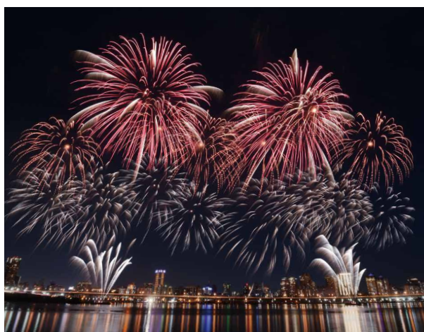
Taipei Valentine's Day