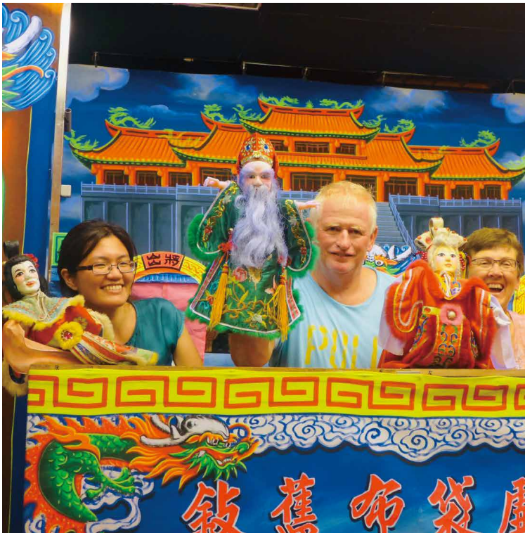
The See-Join Puppet Theater Restaurant