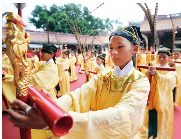
Confucius 2569th Birthday Celebration Commemoration Ceremony

To honor Confucius, the Greatly Accomplished Ultimate Sage and First Teacher, and his spirit of making no social distinctions in teaching, and to commemorate the profound influence this had had on Chinese culture, the Taipei Confucius Temple holds the Confucius Birthday Celebration Commemoration Ceremony each year on September 28. The Taipei Confucius Temple has engaged in research on the Confucian ritual system for more than 80 years, seeking to preserve the inheritance of the ancient ceremonial rituals, dance, and music, and has faithfully resurrected the complete process of 37 elaborate ritual procedures in the Three Consecrations and Ya Yue Dance. These fully reflect the essence of Confucianism. If visiting Taipei, come enjoy this rare opportunity to witness the cultural beauty of ancient rituals and ceremonies.