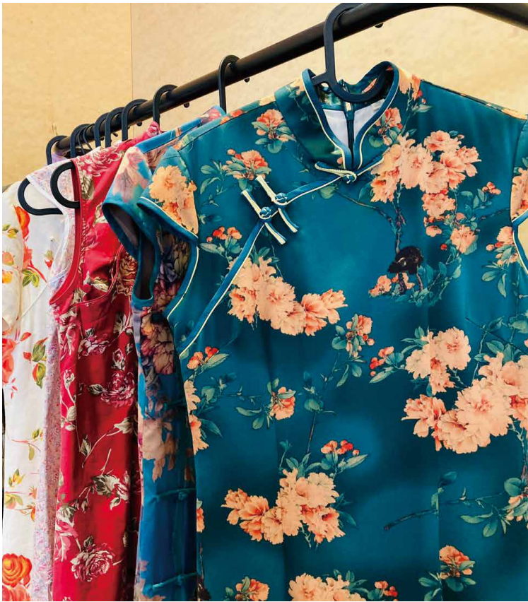
Dadaocheng Visitor Center