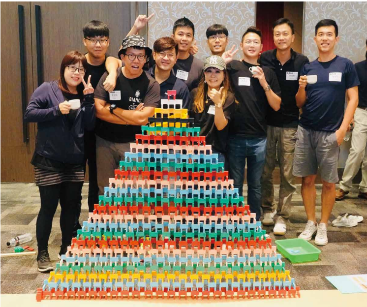
Taiwan Domino College